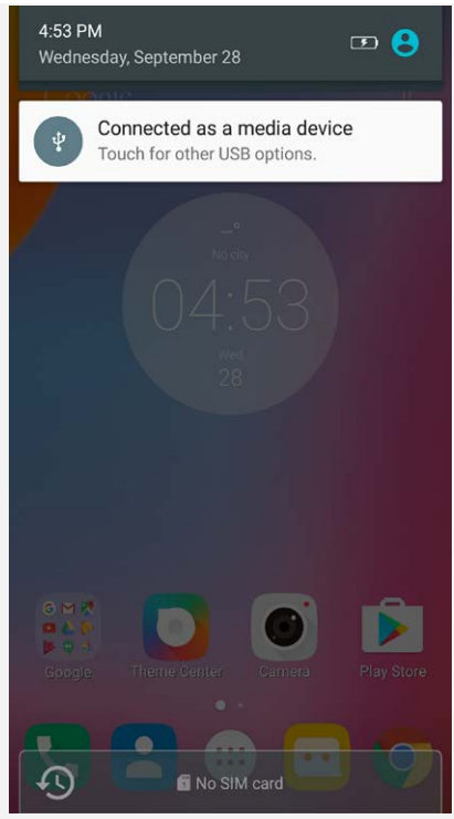
Figure 1: Notification